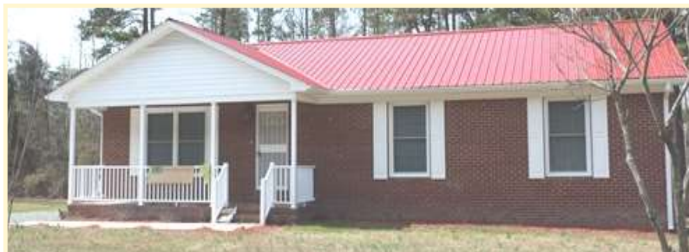
Our new home at 4265 Thompson Mill Road, Graham