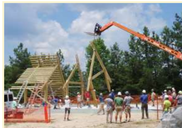
Barn Raising 7/12/14

Benevolence Farm is firmly planted in rich soil and the sun is shining brightly. Now we need the sustained and deliberate support of our community to hire the necessary staff to oversee day-to-day operations and implement the comprehensive programming we have carefully developed with the guidance of our special advisors - who themselves have experienced the crippling challenges of returning from prison without support. We are sincerely grateful for all of the fabulous help we have received AND we need you now more than ever to set Benevolence Farm in motion ~ Your support is critical to enable us to start providing employment and housing to women who are eager to move in and MOVE ON with their lives.