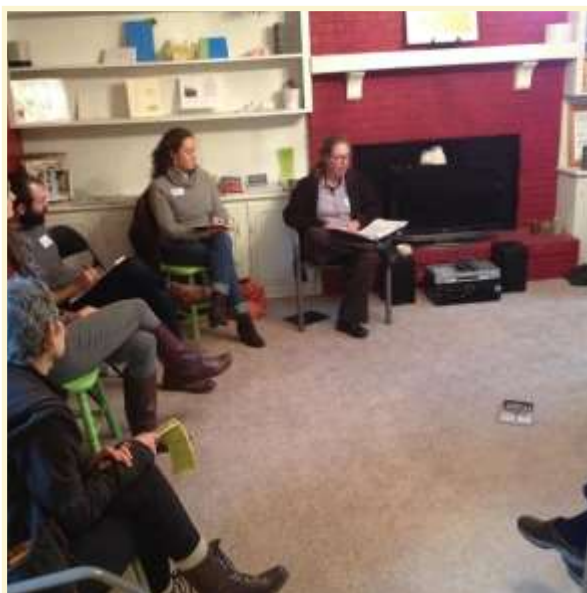
Library and gathering room for classes and work- shops

Thanks to the amazing and ardent support of the Snider Family Charitable Fund, we are three bedrooms and two acres closer to achieving our dream!