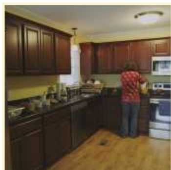
Large Kitchen and Dining Area for group meals