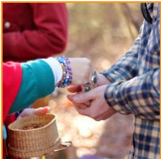
Land Blessing 1/12/14