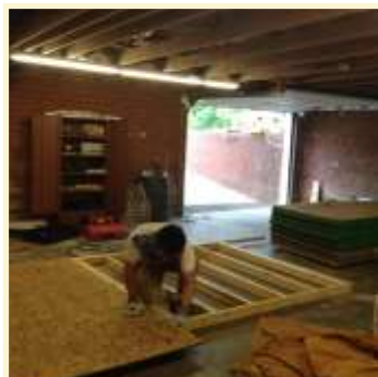
Basement for woodwork- ing and farm product pro- cessing