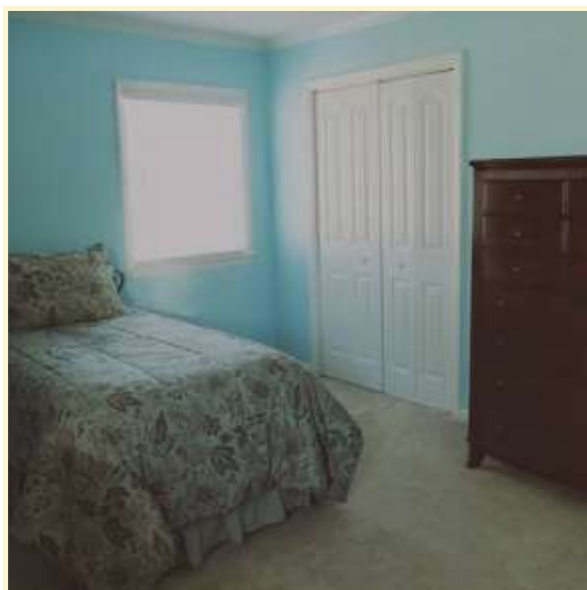
One of the three bedrooms All have sunny windows and bright colors