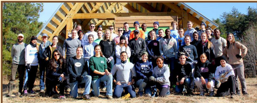
UNC Air Force ROTC