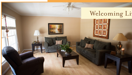
Welcoming Living Room