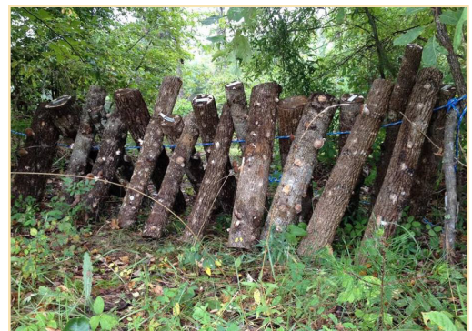
Mushroom Log Workshops