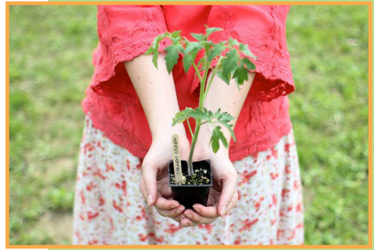
Open House & Seedling Sale