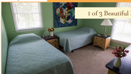
1 of 3 Beautiful Bedrooms