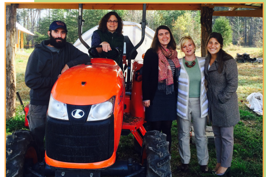
Tractor Granted by Impact Alamance