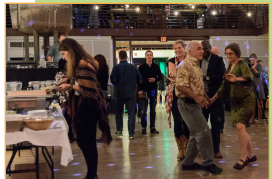
Second Chance Dine & Dance