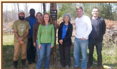
Midtown Raleigh Rotary Club