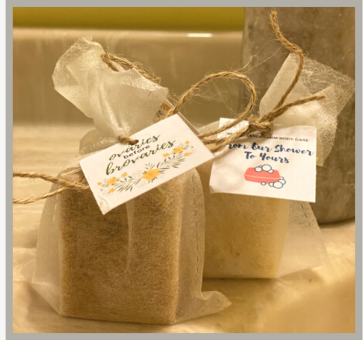
Custom Soap Order for a Baby Shower