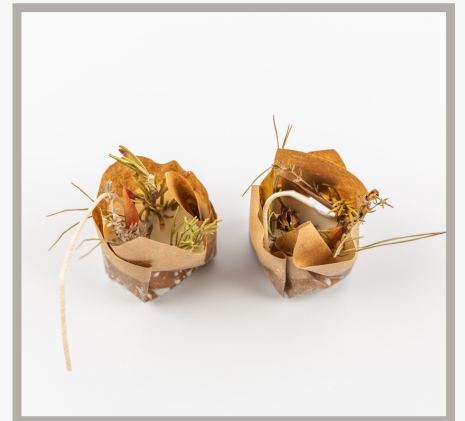
The Winter Collection 2022: Cranberry Chutney candles, Cypress & Bayberry candles, Soy Wax Fire Starters