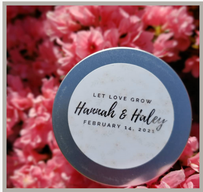
Healing Salve with Custom Labels for Weddings