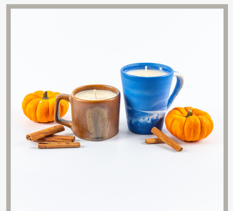
The Autumn Collection 2022: Fall Harvest candles and Pumpkin Spice Latte candles in Second Chance Mugs from Haand