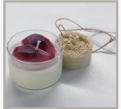
The Sweetheart Collection (Valentine's Day 2022): Sweetheart Candles and Vanilla Luffa Soap